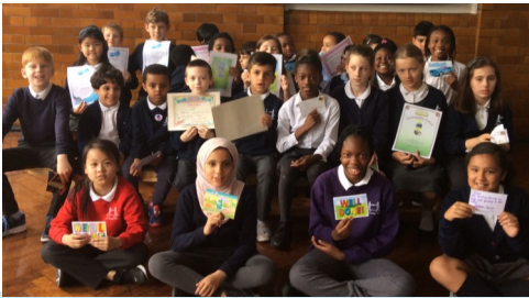
Postcard and Certificate Winners