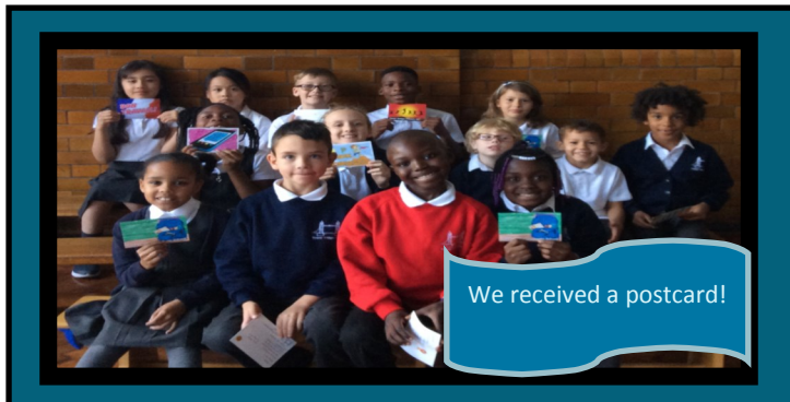
We received a postcard!