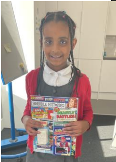
Reading Raffle Winners