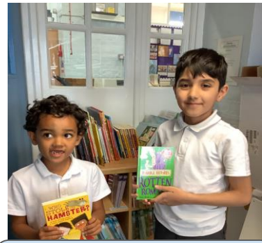
Reading Raffle Winners