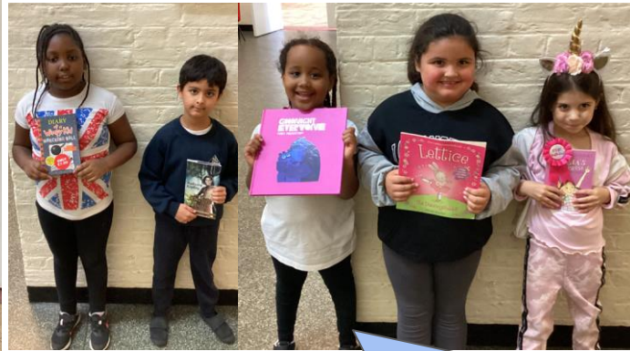
Reading Raffle Winners!