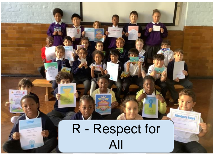
R - Respect for All