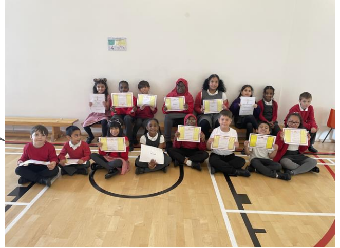
S - Striving to improve!