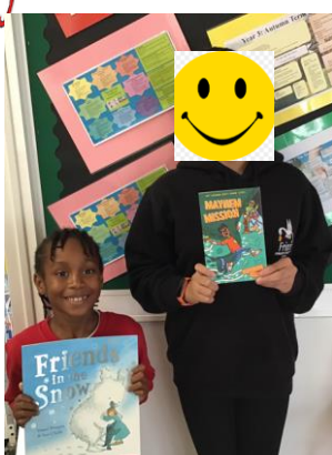
Reading Raffle Winners