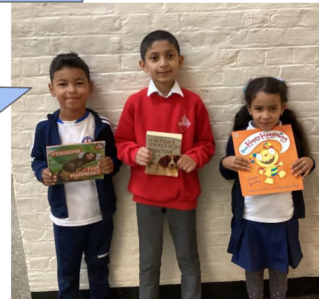
Reading Raffle Winners!