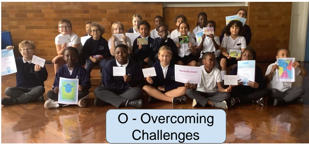
O - Overcoming Challenges