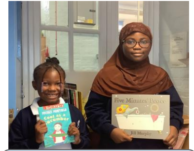
Reading Raffle Winners