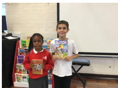
Reading Raffle Winners