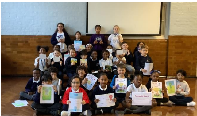
D - Diversity is celebrated