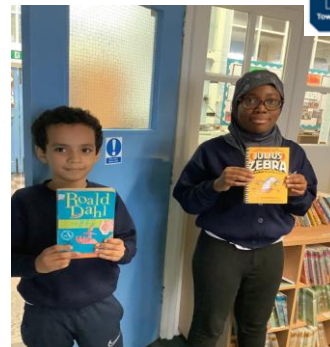
Reading Raffle Winners