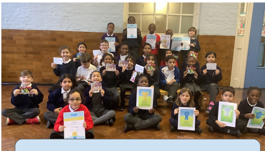
E - Excellence, Enjoyment and Effort