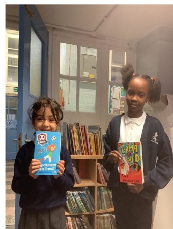
Homework Project Raffle Winners