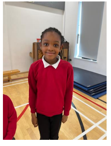
Reading Raffle Winners