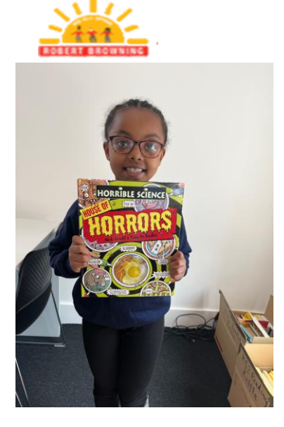
Reading Raffle Winners