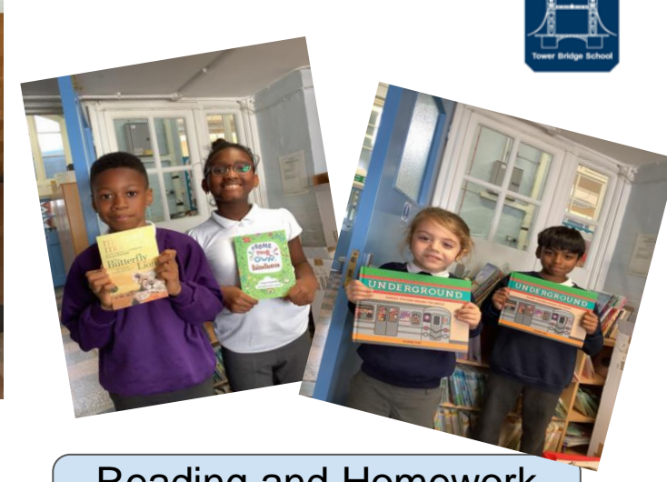
Reading and Homework Project Raffle Winners