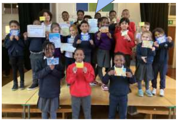
Reading Raffle Winners